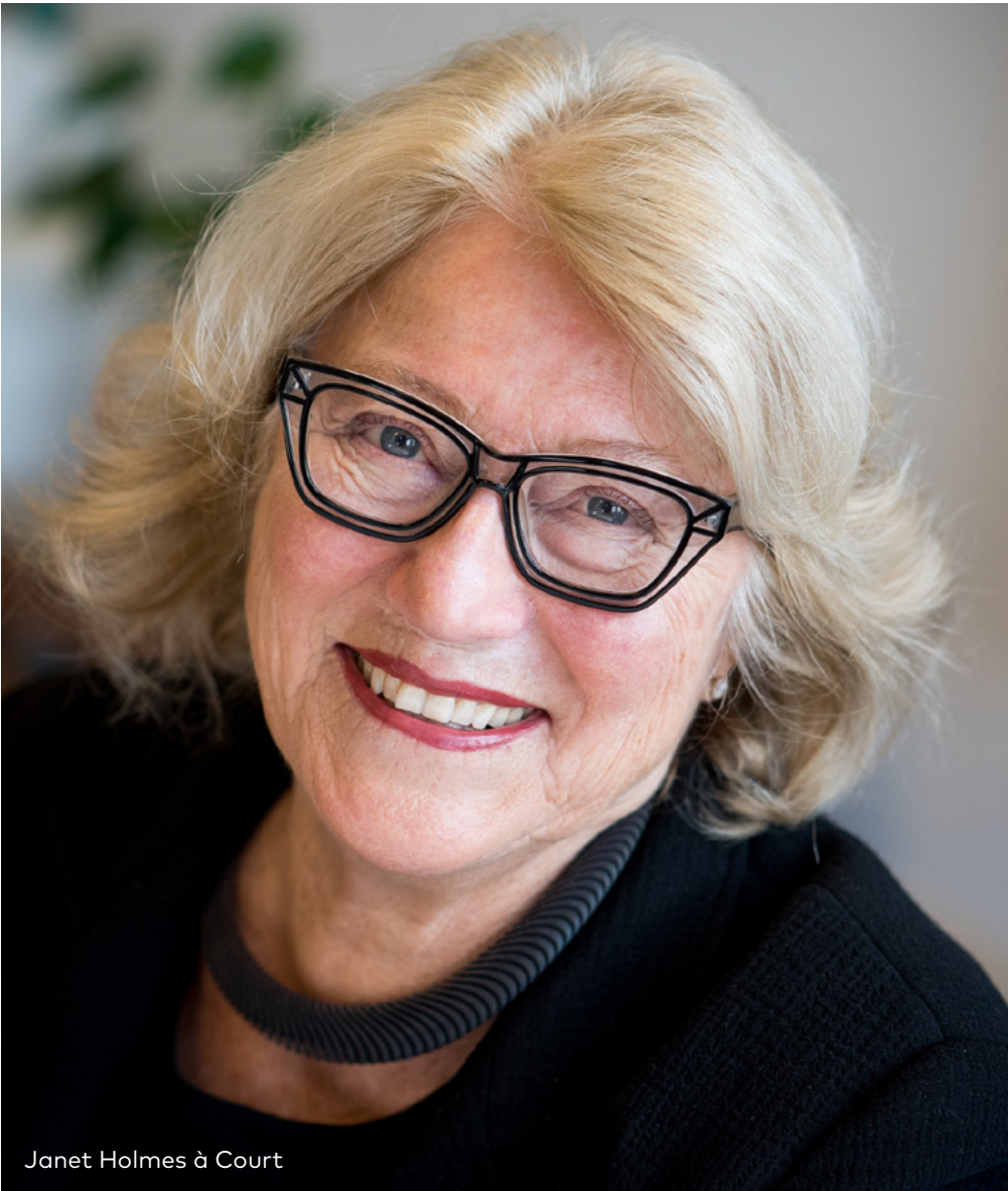
Janet Holmes à Court