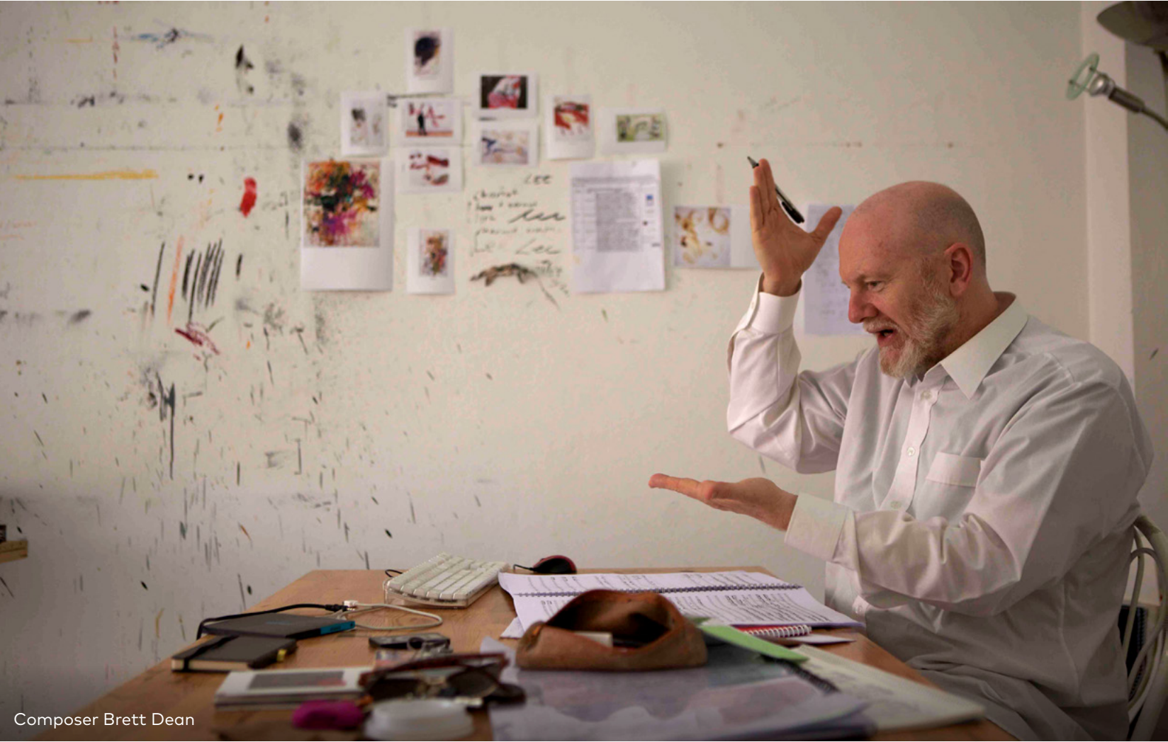
Composer Brett Dean